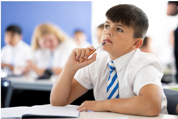
To be an outstanding school, developing outstanding individuals