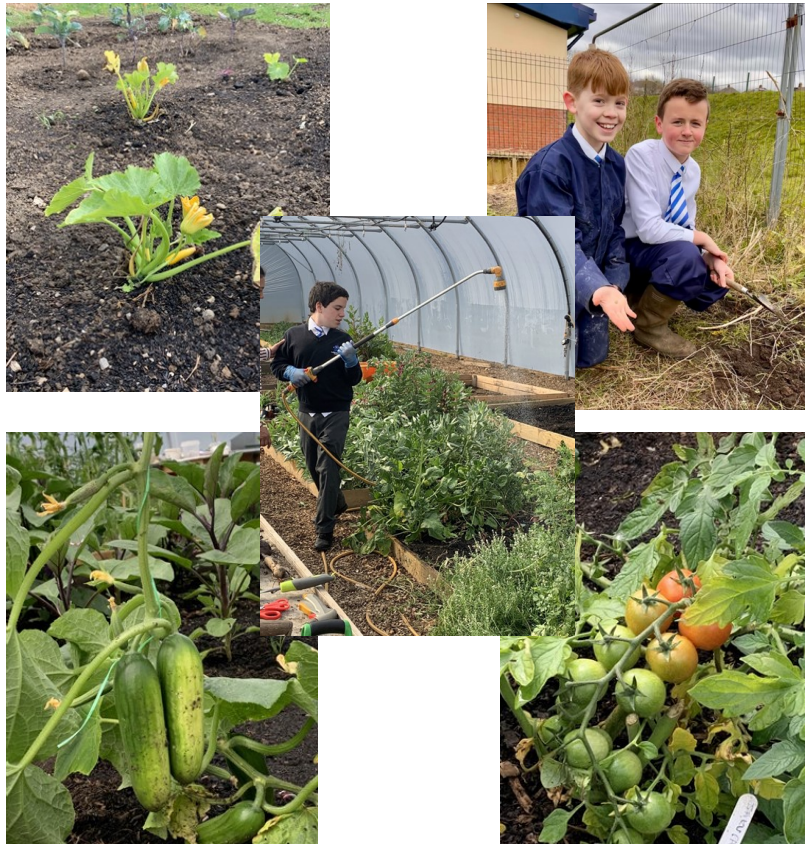
To be an outstanding school, developing outstanding individuals

Our Year 7 pupils thoroughly enjoy their Health and Wellbeing lessons in the LHS garden and polytunnel. They prepare the ground for planting, sow and nurture a wide range of fruits and vegetables, and then harvest the produce to cook delicious and healthy meals.