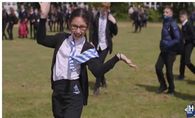
To be an outstanding school, developing outstanding individuals