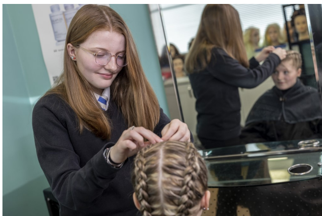
To be an outstanding school, developing outstanding individuals